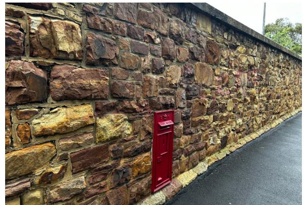
Last Mail box for miles...would be COOL if there actually was a mailing system!