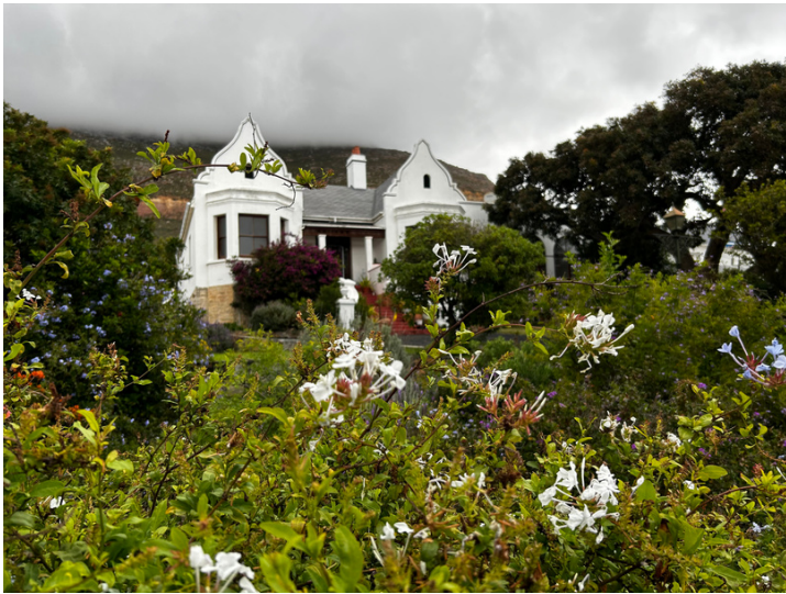
Room with a view.. a very nice view!