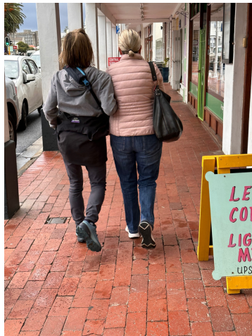
Stairway to heaven.. or coffee!