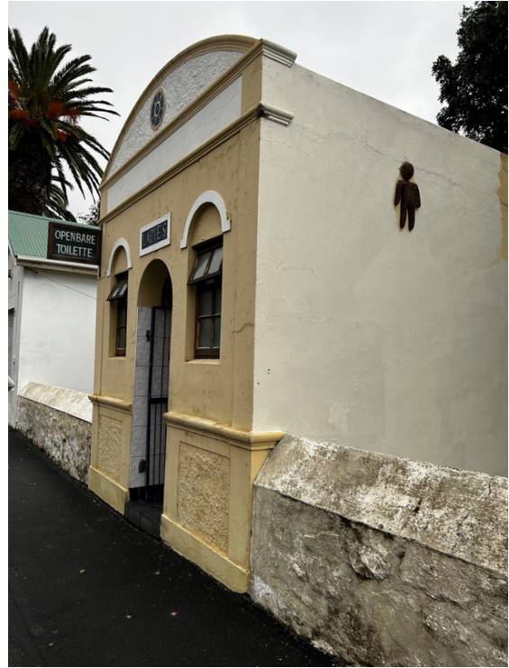
Public rest room

The Warriors Room was used by the M.O.T.H.s as the Snoekie Shellhole from 1952 to 1983. Portico added 1989.